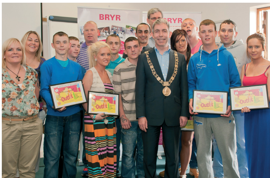
Dublin City's Lord Mayor Helps Celebrate Outfit Graduation